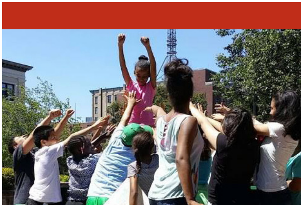
LSWW students create a human statue in Lawrence's downtown historic district.