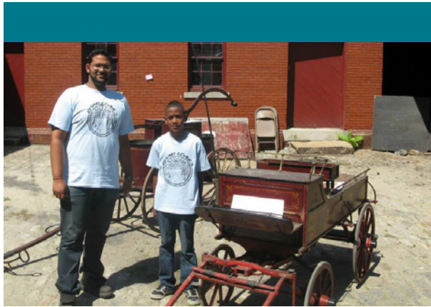
An LSWW writing leader and student teach visitors about historic fire-fighting equipment.

*Participants must attend all three weeks of the program.