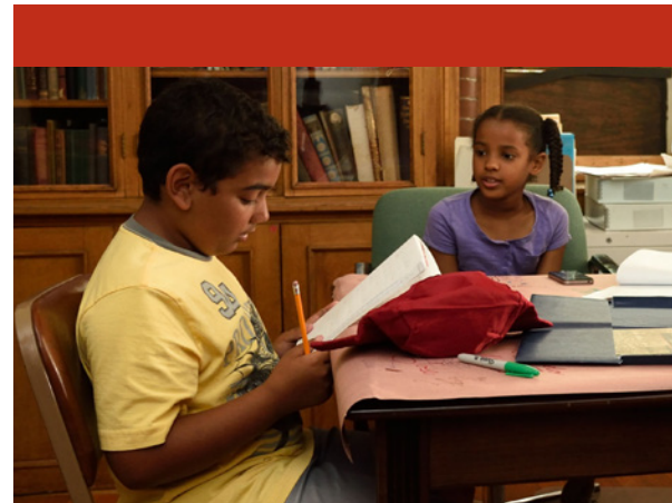
To learn more about their city as well as valuable research skills, LSWW students explore archival documents together.